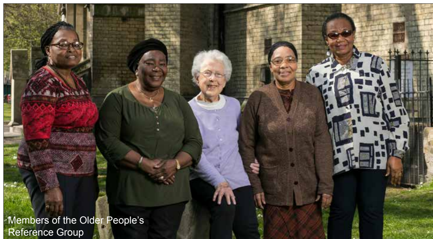
Members of the Older People's Reference Group

Although older people are definite in their views and strong in their opinions, not all are in a position to put forward their views.