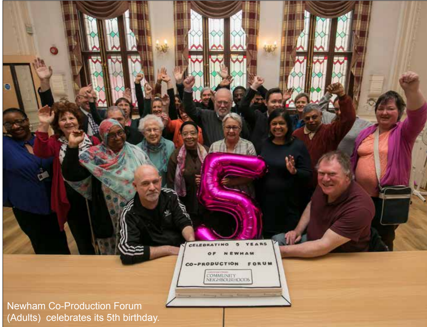
Newham Co-Production Forum (Adults) celebrates its 5th birthday.

Co-Production is our way of working together with residents, carers and staff to design, commission, deliver, monitor and evaluate services in Newham.